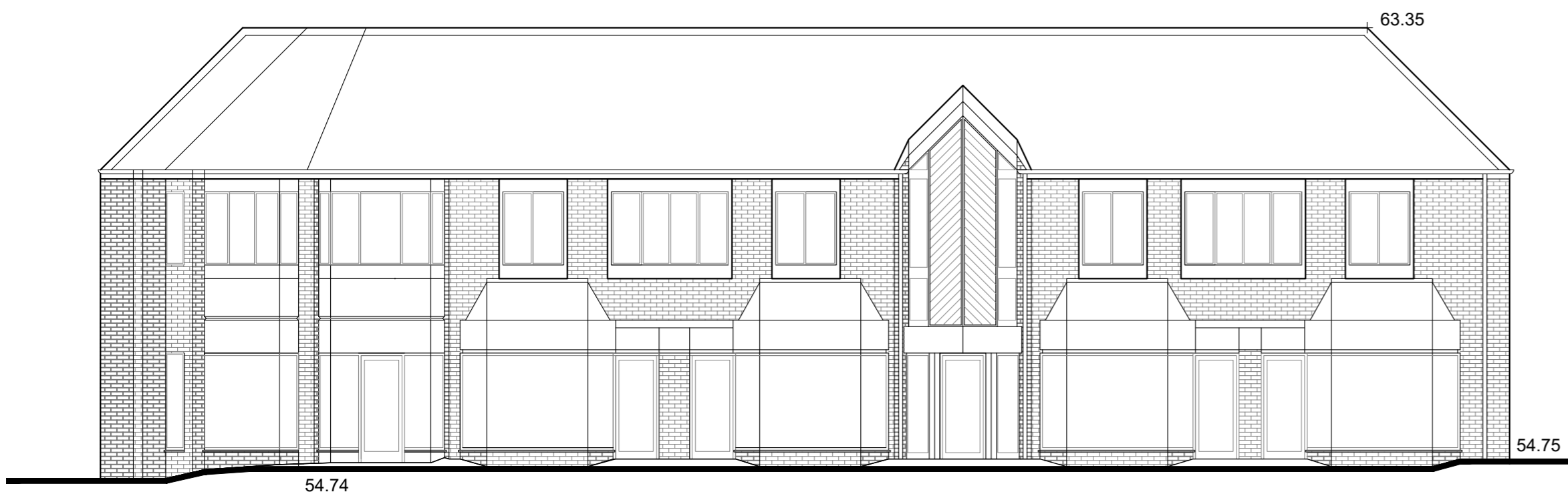
existing north elevation